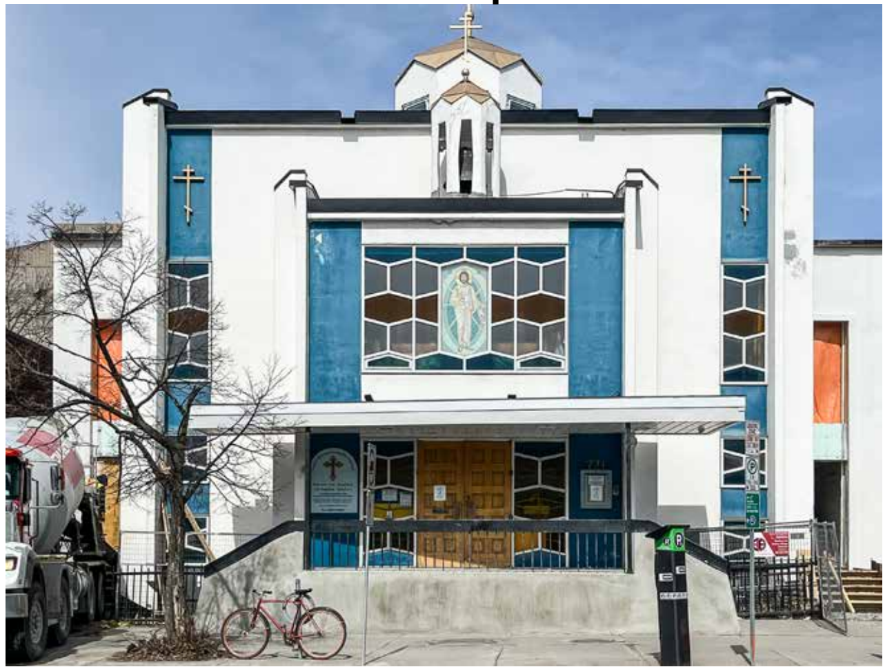
The congregation of Christ the Saviour Orthodox Church chose to stay in Centretown and renovate their building.

Renovating such a creation was an architectural and engineering challenge