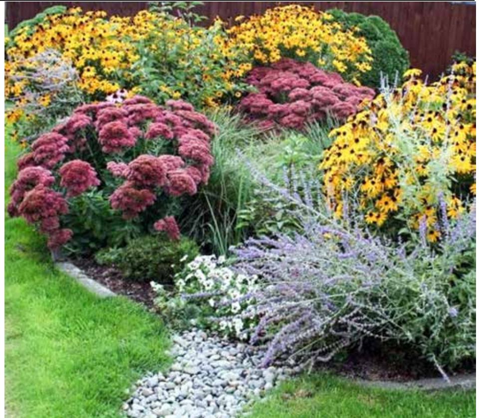
Rain gardens have well-draining soils which allow rainwater to infiltrate into the ground. RAIN READY OTTAWA we are rapidly losing natural forest, all before we fully understand the interconnectedness of forest plants and trees so important to biodiversity. Ottawa has recently witnessed the massive clear cutting for the Tewin development and the loss of trees at Hunt Club on airport lands.

He pointed out that a majority of our native tree species are threatened and that