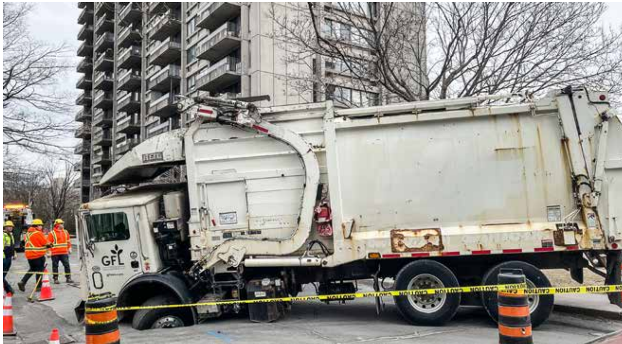
One of the classic signs of spring is the pothole, but this one on Cooper was a doozy! BUZZ reader Nancy Walking captured this scene on March 26 in front of her building. The front left wheel of a garbage truck was captured by a large hole in the street, completely blocking all traffic.