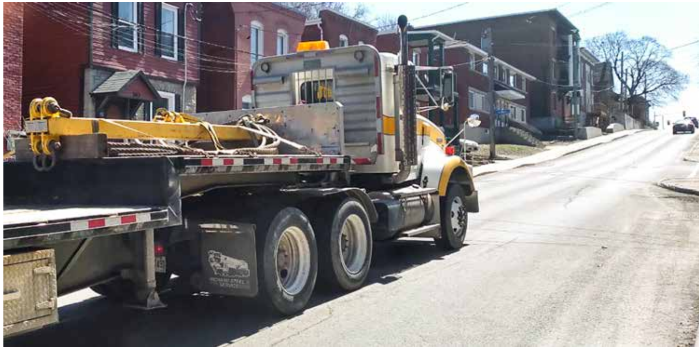
Large trucks rumbling through the residential area on Booth Street over to LeBreton Flats have been a problem for years.