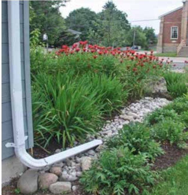
This downspout drains into a rock bed and waters nearby plants, rather than going into the city’s stormwater system. This reduces the need for expensive city water and decreases the risk of flooding. RAIN READY OTTAWA