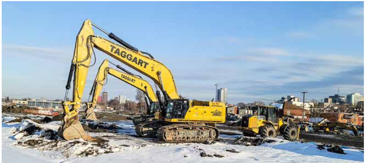
Left: Mosaïq phase 2 on the south side of Gladstone at Rochester. Above: Gladstone Village near LRT Line 2.

Mosaïq Phase 2, with 273 new homes in two nine-storey high rises and three townhouse blocks, broke ground last fall. OCH will partner with PAL Ottawa to provide 86 homes for older members of the artistic community in one high rise. It will have space for families,