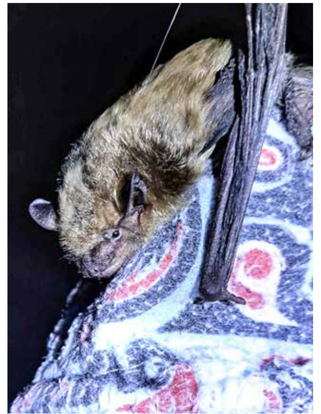
A Big Brown Bat wrapped in a fleece blanket, after being tagged by Carleton University researchers investigating bat habitat.