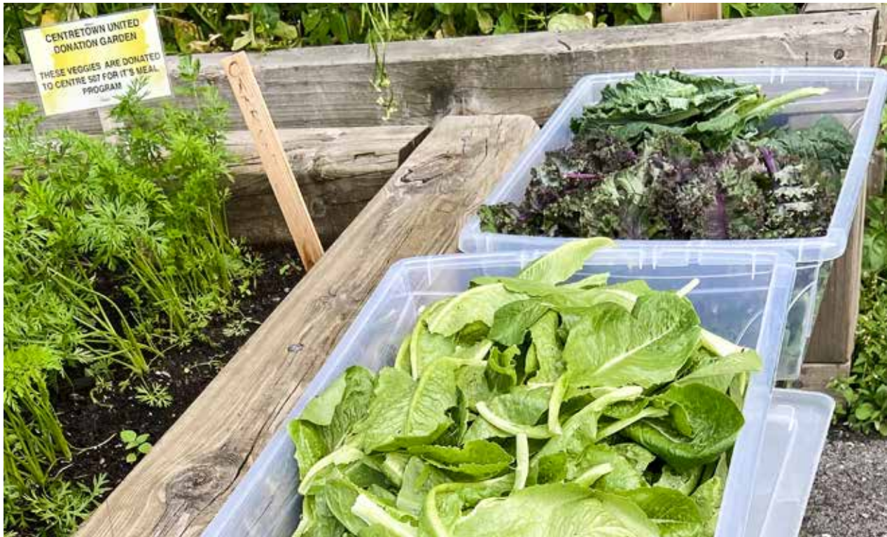
The greens and vegetables are harvested to feed the clients of the the Centre 507 drop-in and resource centre.