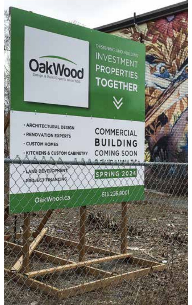
This sign recently appeared in the long-vacant lot at 816 Somerset Street West, indicating that OakWood Design & Build was planning a four-unit commercial building there, to be started this spring.

Actions include the use of urban heat maps, growing the urban forest, public education, building infrastructure to be resilient, and building energy and climate resiliency into future growth and development decisions. More info and a survey: engage.ottawa.ca/climate-resiliency