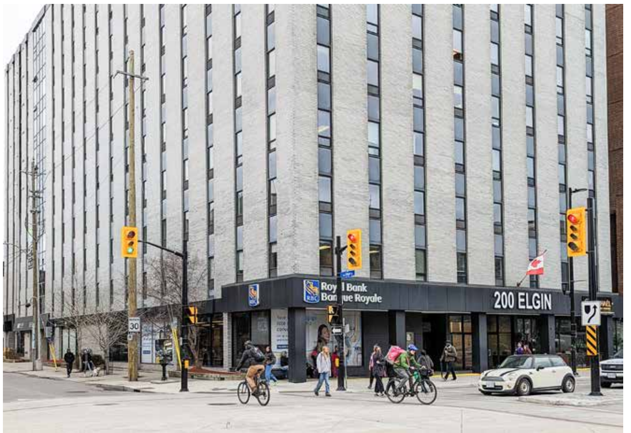
The current law firms and professional services tenants of 200 Elgin will be displaced for a conversion into apartments.

This confirms the generally held perception that