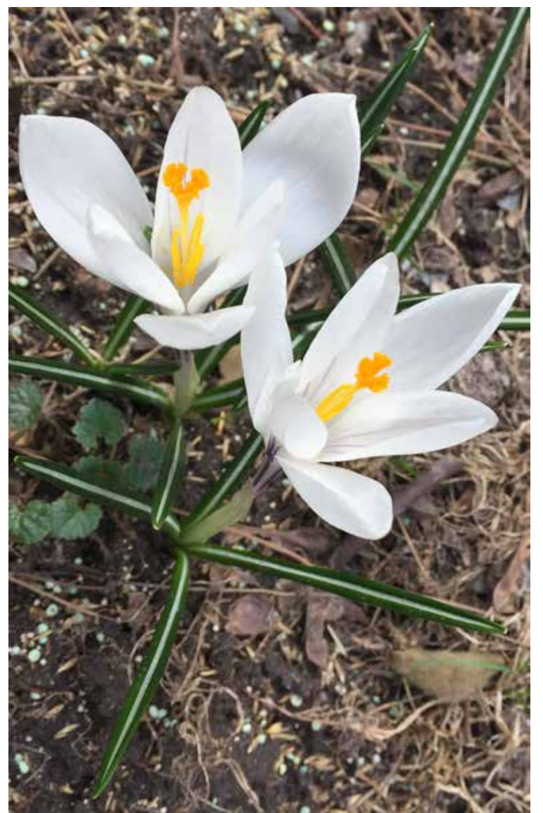
Signs of spring have come early to Centretown in 2024 – but they’re beautiful nonetheless. Left: A tree blooms delicate white flowers in the garden at Knox Presbyterian Church on Elgin Street. Above: a house on Waverley Street near Elgin had a front-yard embroidered with white and purple crocuses when The BUZZ walked by last week.