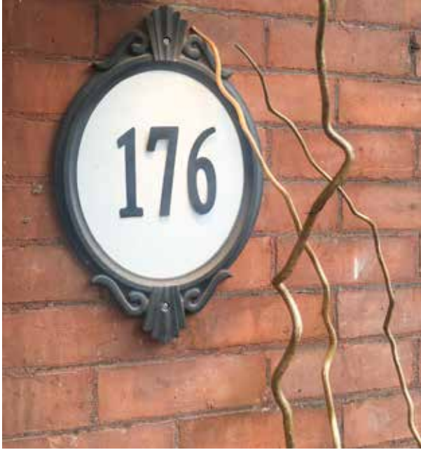
There is a 176 Florence Street in Centretown, but that number is completely missing on the nearby Flora St.

With the same statistics, a study can scare or reassure people. If a percentage doubles, we have to ask what the base percentage was in the first place. Was it 50 percent? Wow! In that case we’re now at 100. Now I’m really listening. However, if I’m told I have an infinitesimal chance of shortening my life if I drink two cups of