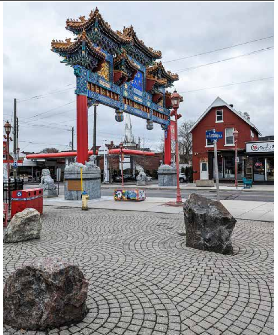
The site where the new monument will be placed, replacing the boulders.

"We fear those de-registered properties will be unprotected and lost to public awareness for years to come, the blame for which lies with the provincial government."