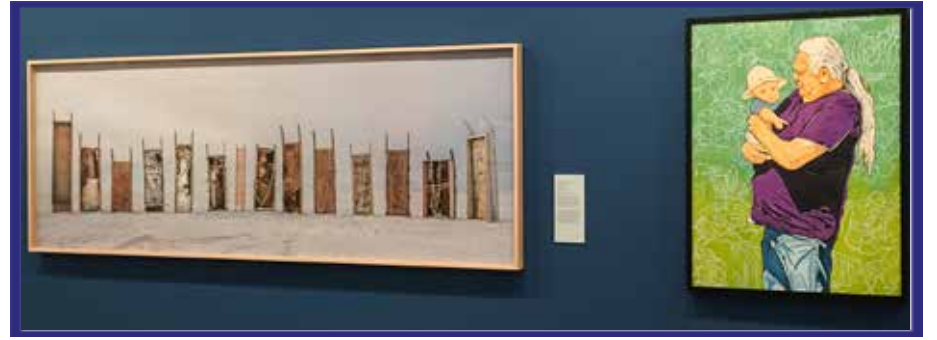
Almost-hidden art galleries, 7