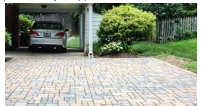
A permeable pavement driveway.

practice many of the ideas introduced by the speakers – just in time for planning garden and yard makeovers for the spring season.