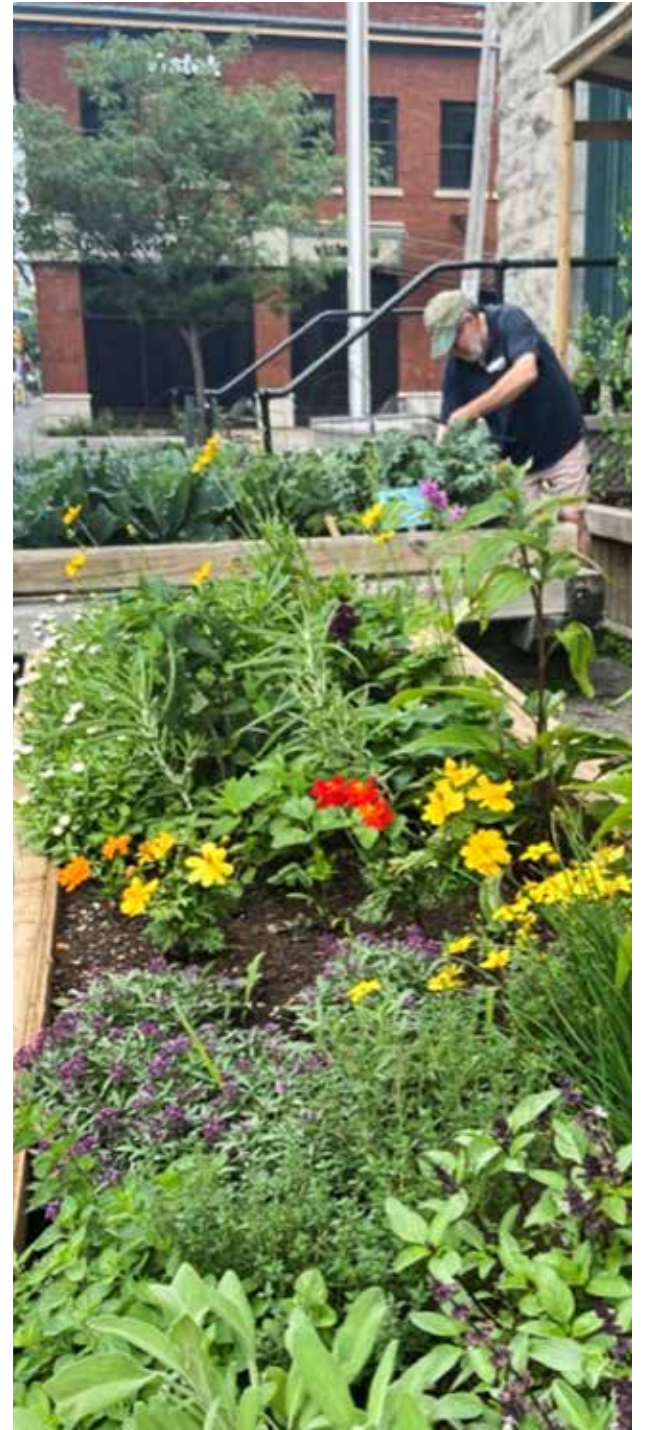
A volunteer at work in the garden beside Bank Street's busy traffic.

If you would like to be a volunteer either on a regular basis to water and weed, or for occasional larger tasks such as spring planting or fall clean-up, please contact centretowngarden@yahoo.com .