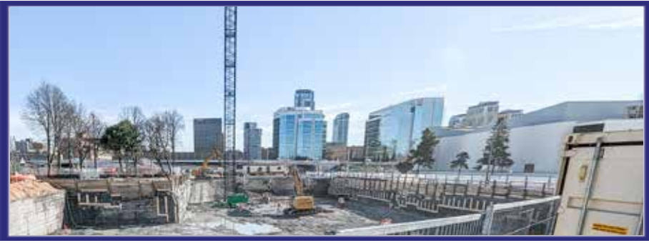
New projects could transform Dalhousie, 7