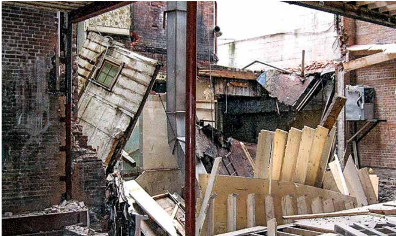
A scene of chaotic destruction: Somerset House’s interior immediately after its partial collapse in 2007.