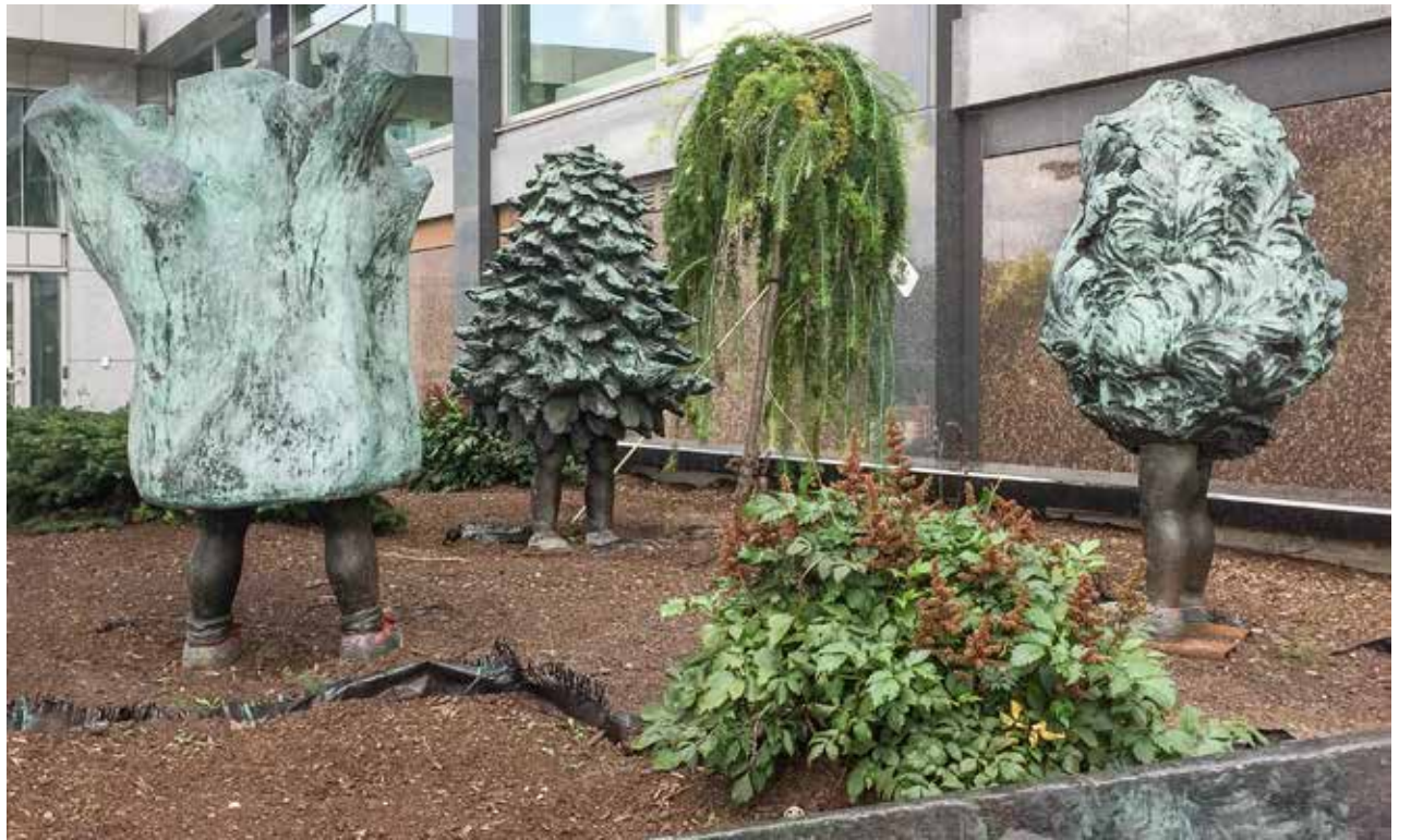
The three Nature Girls bronze statues in front of 80 Elgin last fall: (l-r) Stump Girl, Conifer Girl, and Bush Girl.