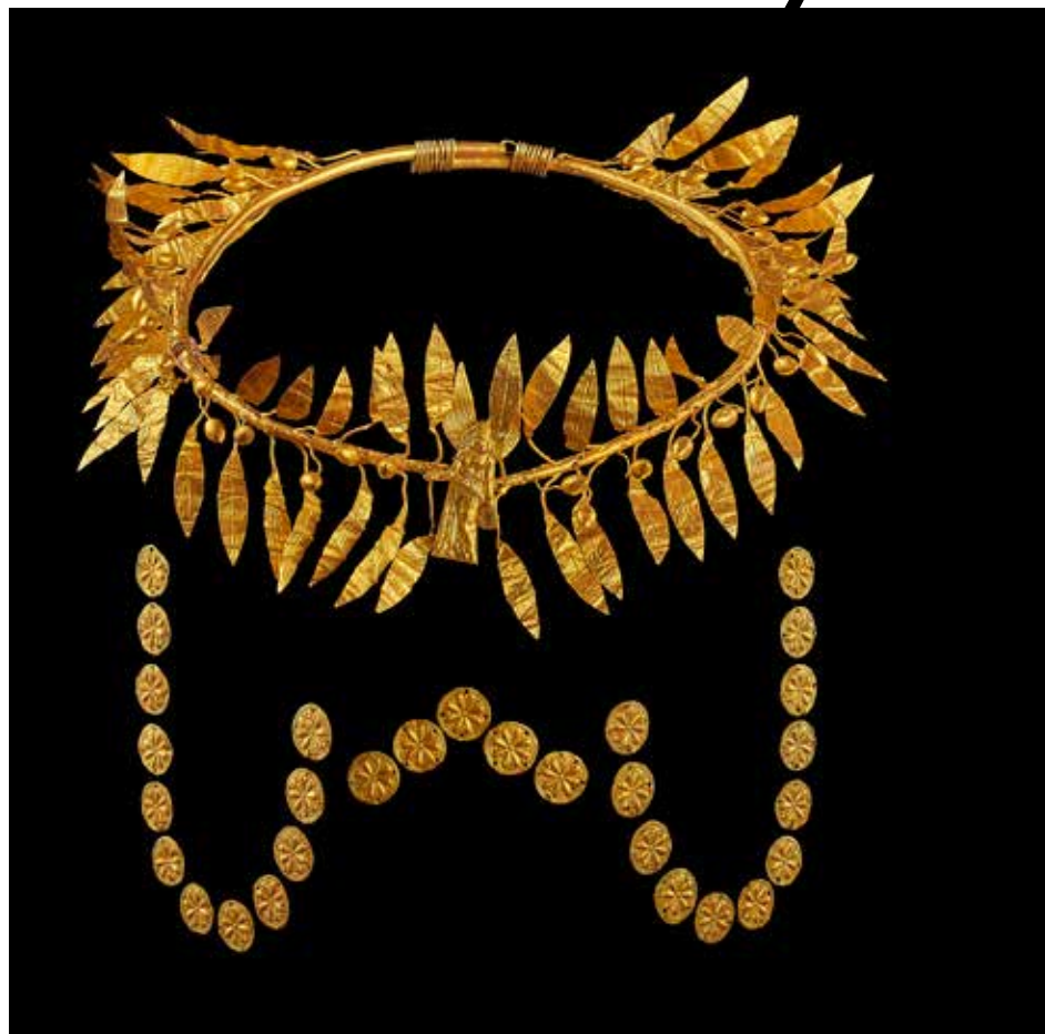
From the First Royals exhibit: a Gold Wreath, Iron Age, 375–325 BCE. The figure on this wreath represents Nike, the Greek goddess of victory. Much Thracian wealth came from tributes paid by Greek colonies on the western coast of the Black Sea.

The championship cup that appears in the play is brought to every production and every theatre company that produces the play is engraved on the trophy. Tickets and show-times: www.thegladstone.ca