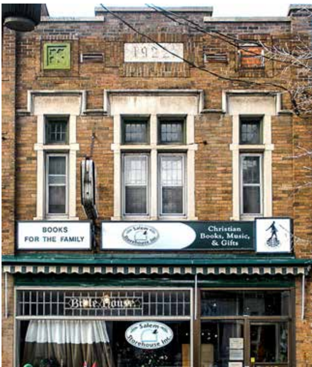
The city's Built Heritage Committee has reiterated its support for a heritage designation for The Bible House.

It determined that the rationale for a heritage designation was sufficiently strong, and that any financial hardship could be countered by the city's heritage grants program which provides up to $25,000 in matched funds every two years. The committee therefore recommended that council follow through with its intention.