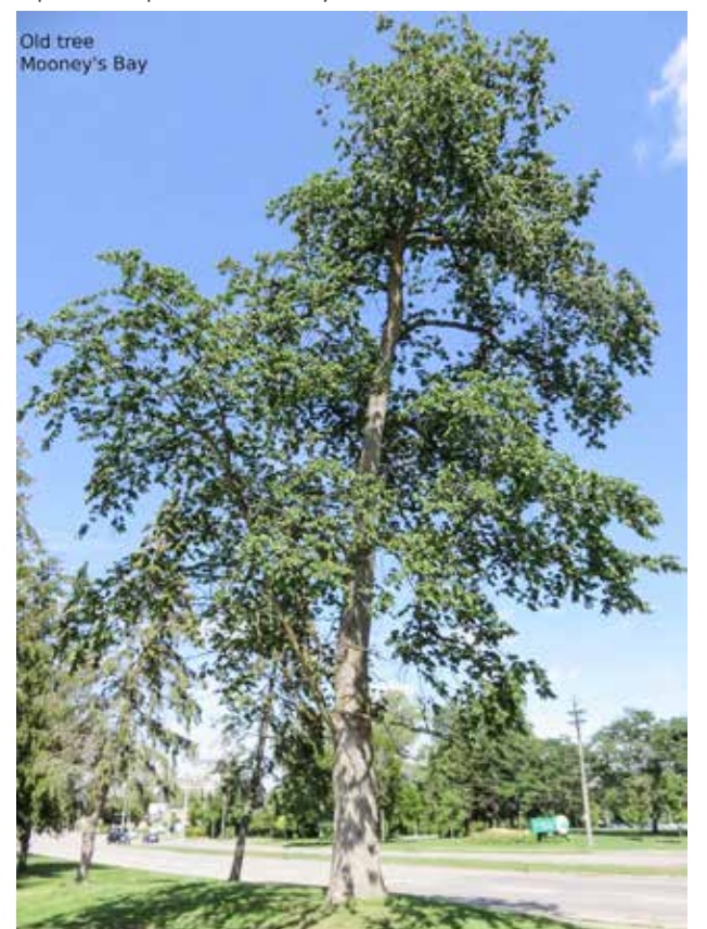
Old tree Mooney’s Bay A Slippery Elm tree at Mooney’s Bay. Many native trees like this are never planted, says Owen Clarkin. OWEN CLARKIN