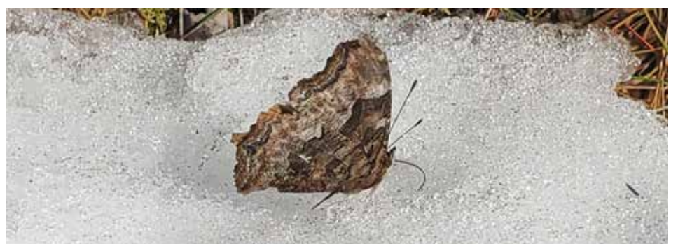
The rescued butterfly drinking from snow earlier this month.

Explore the world... next door 566 Gladstone (between Bay and Percy) 613-722-0061 margofresh.com