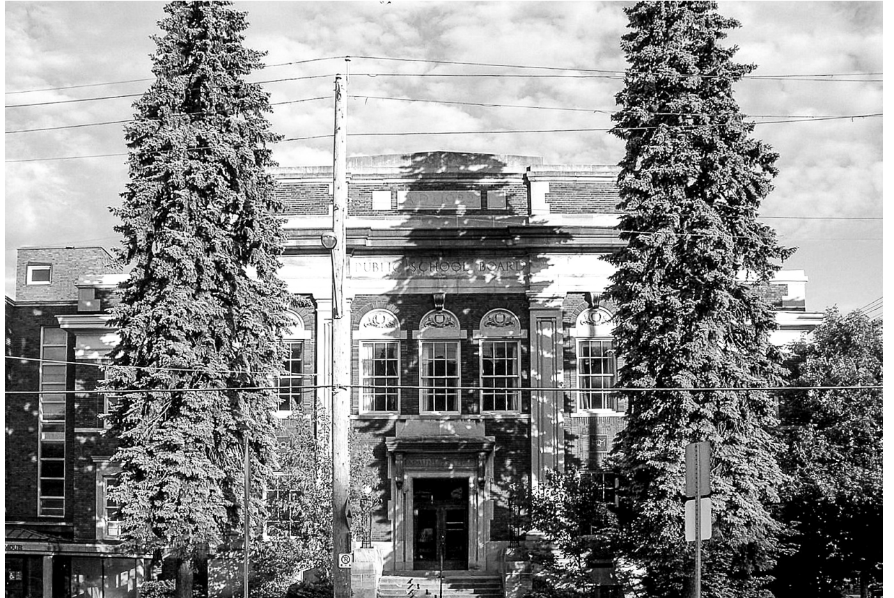
The former Ottawa Board of Education headquarters on Gilmour Street, now owned by Ashcroft Homes, has been vacant for over 20 years. Serious wall and foundation settlement is now occurring. It has recently been boarded up in an effort to prevent further water penetration.

At this point, city staff are a) continuing to pursue legal action, b) trying to get the owner to undertake the repair orders, and c) discussing potential development