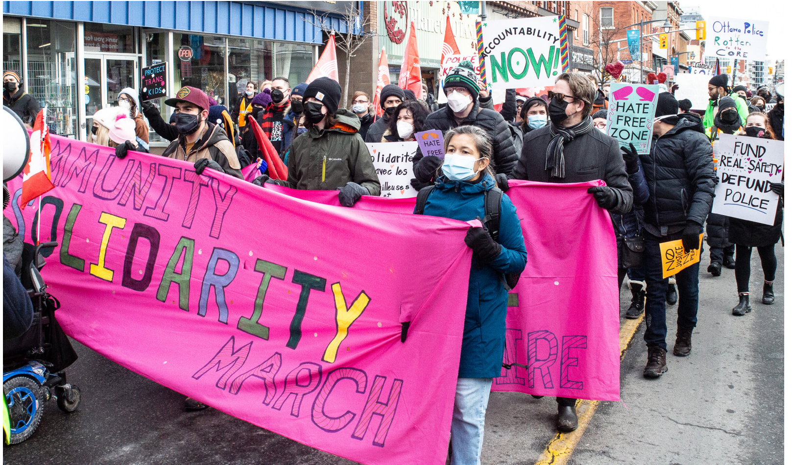
Two weeks after the convoy occupation finally ended, about 300 residents attended a Community Solidarity Ottawa Accountability Rally and March on March 5. Speakers called for a investigation into the "abject failure of governments to protect the community from far-right occupiers," tying it to failures in handling the pandemic. Starting at City Hall, marchers continued down Elgin and up Bank. THE BUZZ