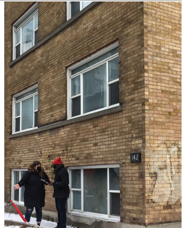
Tenants in an affordable low rise at 142 Nepean Street are currently facing demoviction.

Without an actual authority to enforce accountability, any city commitments to housing protection are moot. An official and independent Ottawa housing commissioner would be able