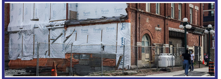
"Making a mockery of City Hall", 3