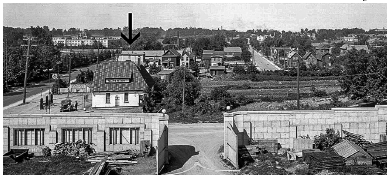
What would a Skyline column be without an accompanying historic photo? This is how the Preston-Carling district appeared in 1944, with an arrow pointing to the new building's site.