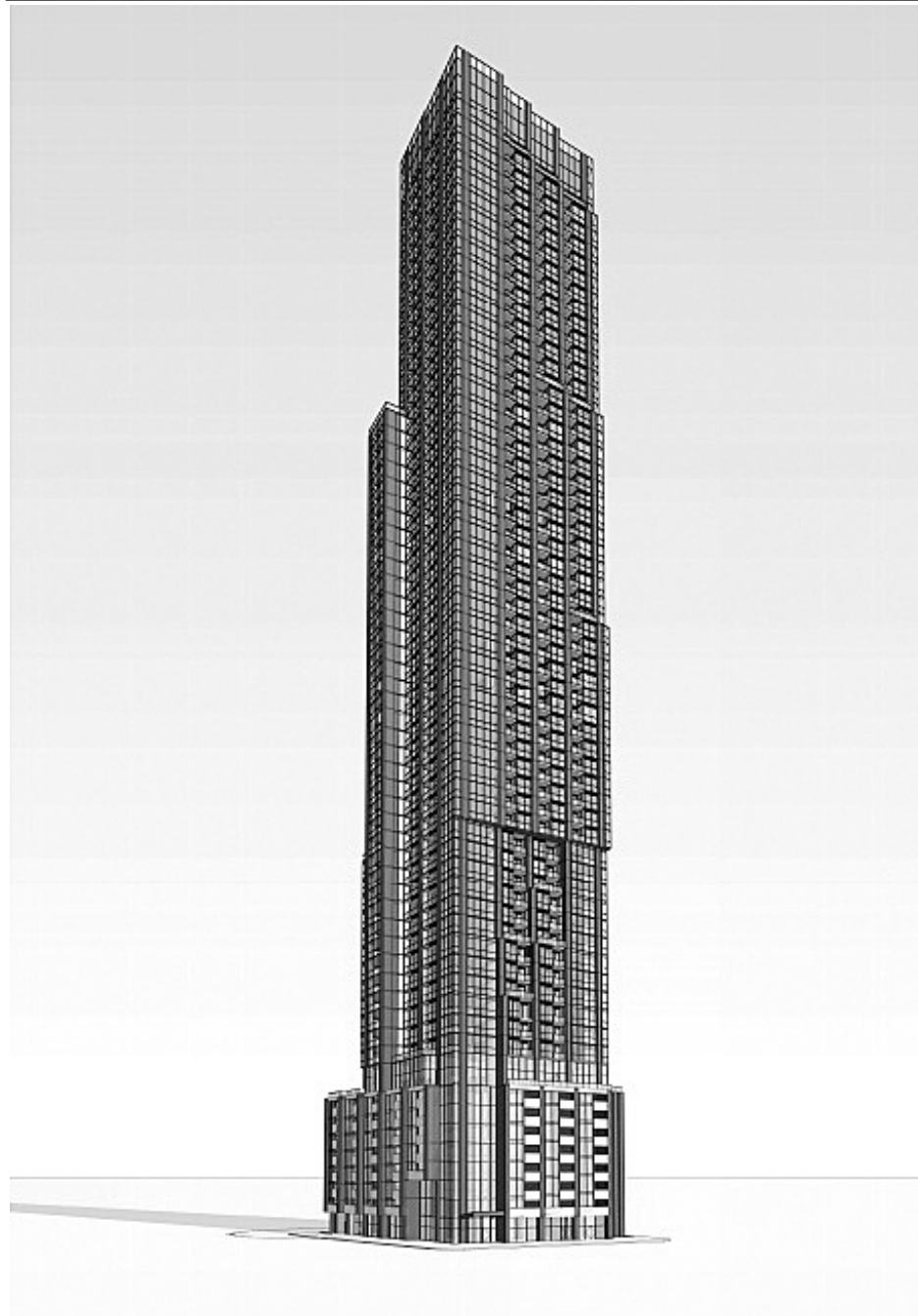
An architect's perspective drawing of the 60-storey ICON II at 829 Carling at Preston. The emphasis is on verticality.