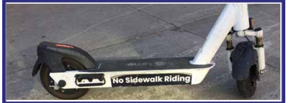
E-scooters to start buzzing, 3