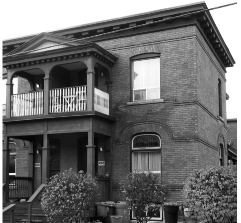
Intricate brickwork designs decorate this building in the proposed HCD.

Over 80 percent of the buildings in Western Centretown were built between 90 and 156 years ago (1865-1931); the vast majority constructed between 1885 and 1914. The buildings are mostly quite large but vary from modest single houses to huge mansions and to duplexes, triplexes, and old-style row houses. There are a very limited number of small apartment blocks, unlike Central Centretown, which