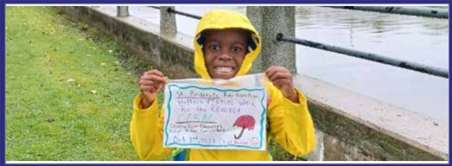
Centretown steps up for its food centre, 4