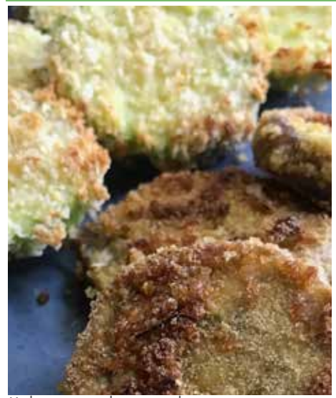
Malagan eggplant rounds