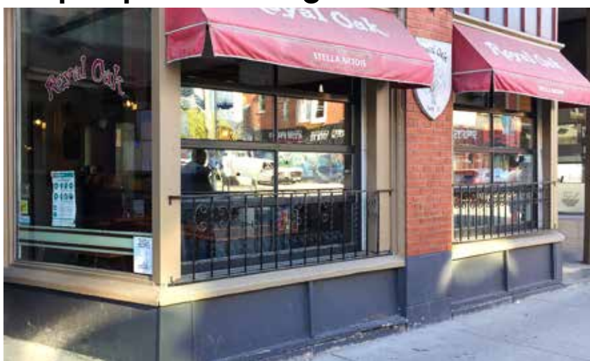
The windows of the Royal Oak look out onto Bank Street.

They always picked the window table, "They'd always people-watch out the window. They loved to see what was going on on Bank Street, chatting with people. People would always stop by