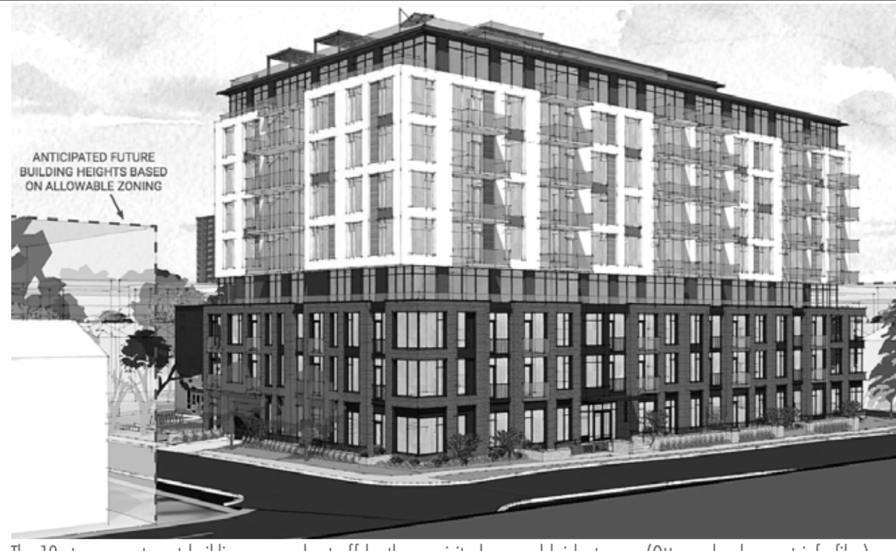
The 10-storey apartment building proposal set off by the requisite lower red brick storeys. (Ottawa development info files)

And what of the latest big-building proposal? The Ironwood Fund Limited Partnership has submitted rezoning and site plan applications to redevelop what was once a 1960's era separate school, later remodeled into a sports and health centre with various other offices. The land is currently zoned as a Minor Institution property. The maximum height limit is 15 metres or approximately five