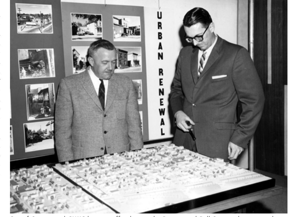
City of Ottawa and CMHC housing officials give the Preston and Bell Street urban renewal schemes an approving glance, 1961.

The new building would contain 139 apartment units and a total of 1,001 square metres of amenity space furnished through common in-