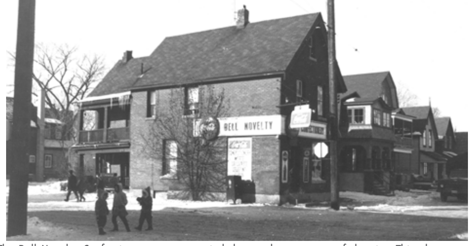
The Bell Novelty Confectionery once occupied the southeast corner of the site. This photo was taken 60 years ago during the city's urban renewal survey.

door and outdoor spaces, private terraces and balconies, and an internal courtyard area. Car parking for 88 vehicles and 79 bicycle parking spaces are to be provided.