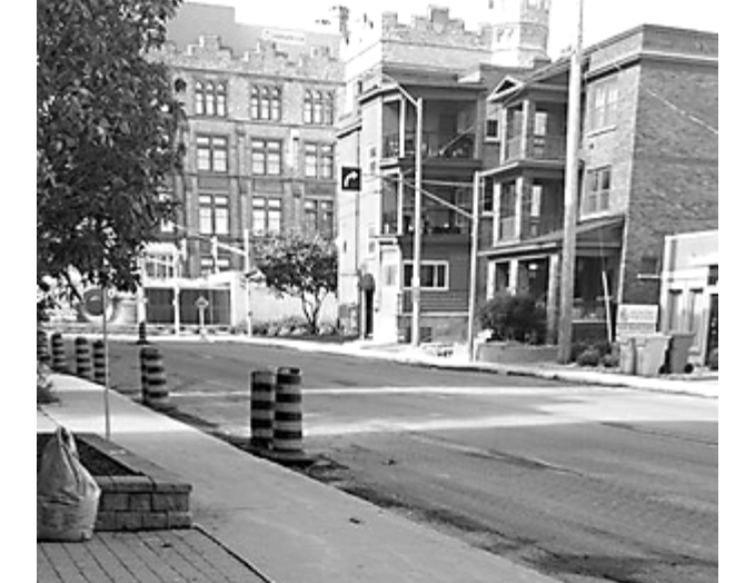
A dangerous section of Metcalfe Street where the curb and the street no longer matched.

that any and all construction sites be wheelchair-accessible. If they aren't, I suggest residents should reach out to their city councillor. And as a reminder to all city councillors and our mayor, please listen to the concerns of the citizens of Ottawa. Many of