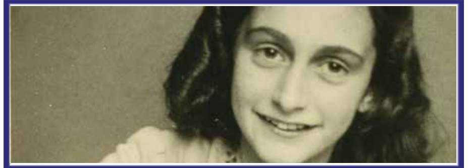
What's on: New Anne Frank exhibit, 8