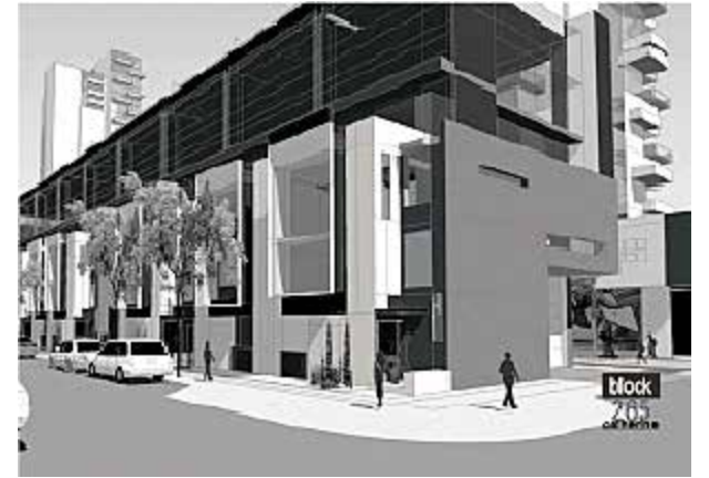
The 2011 proposal featured nine-storey buildings with three-storey townhouses along Arlington. (City of Ottawa report)

Initially, the CDP called for buildings between 16 and 25 storeys along Catherine Street, and that “the fine-grained quality of Arlington Avenue should be considered in building designs.” It appears that this has morphed into 27 storeys, the city’s new go-to height for towers in Centretown. It’s equally unclear as to whether the new developers will adhere