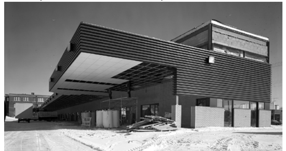
The Voyageur Colonial bus terminal under construction. It opened in 1972. (CMHC)

The plans include “a hub of luxury rental condos, office space, hotel buildings, neighbourhood restaurants, and specialty stores.” That’s quite the departure from a now deserted asphalt wasteland that was once the bus station, and quite a lot to pack into this blowsy block of Catherine Street.