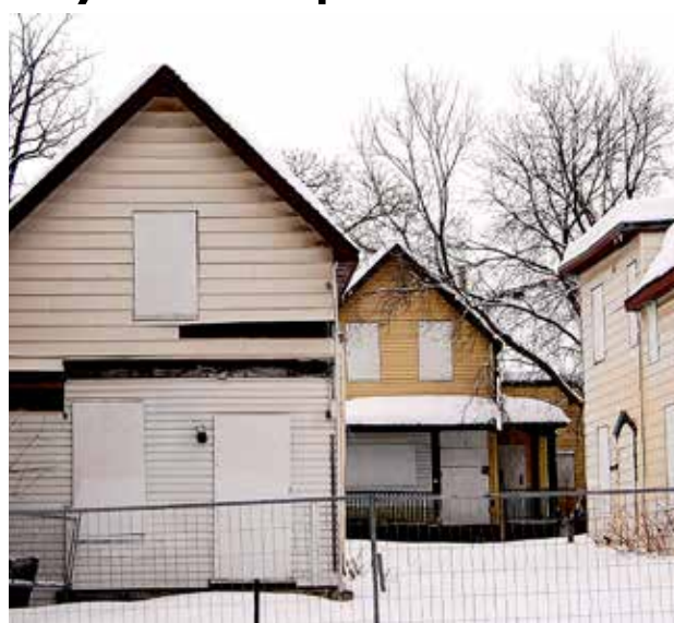
Boarded-up houses in Centretown.