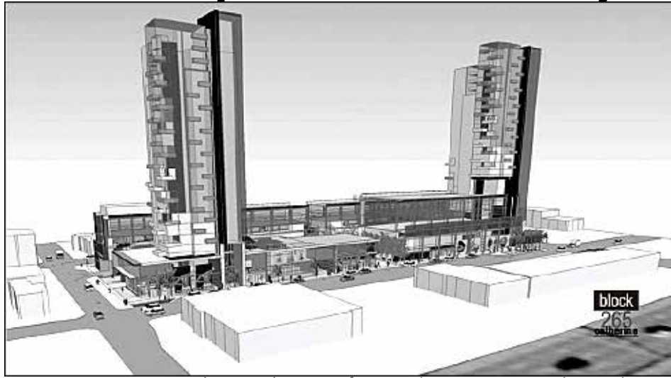
In 2011, Ottawa City Council approved rezoning for 19 and 25 storey towers along Catherine Street as part of a proposed development (called “block265”). (City of Ottawa report)