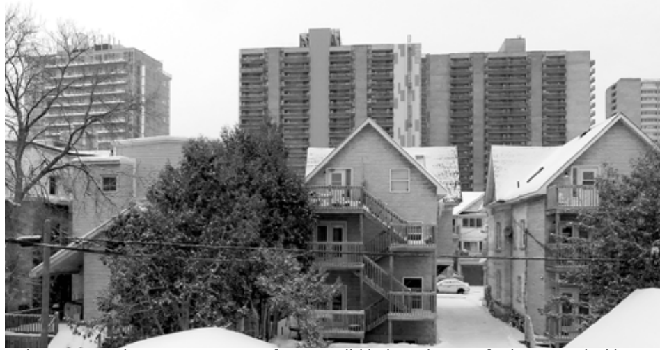
High rises in northwestern Centretown form a wall blocking the view for lower-rise buildings. The only place light can break through is at roadways.