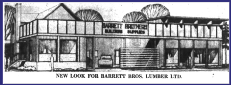
From lumberyard to bus station to condos, 3