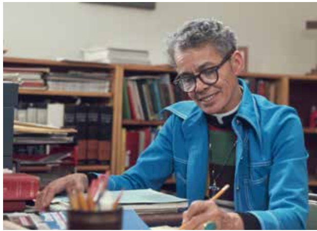
The Reverend Pauli Murray