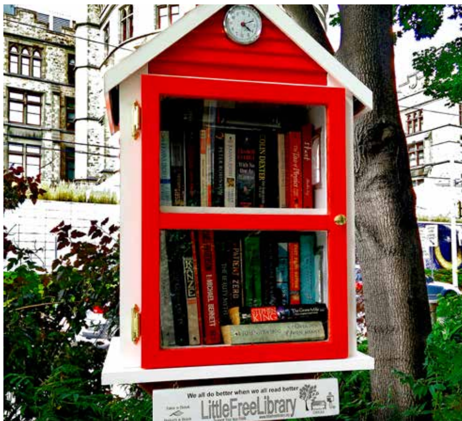
Little Free Libraries are scattered across Centretown. One library provider would like you to use them as a destination for neighbourhood walks, and has compiled a map of them. See our story on page 6.