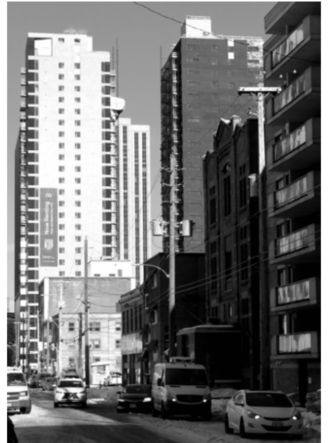
New high rises between Gloucester and Nepean Streets, just west of Elgin Street.

The high-rise and skyscraper “wall” running east-west through northwestern Centretown between Laurier