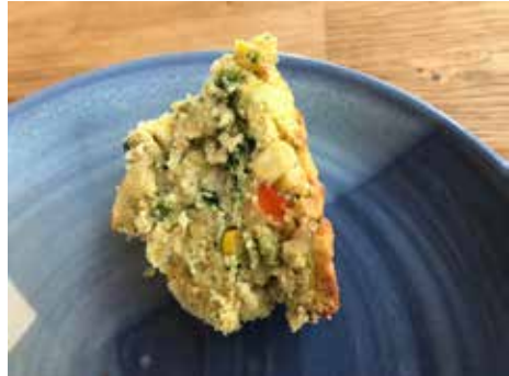
Savoury cornbread is bright with red pepper, spinach, and corn.

Not a fan of the green flower? This soup could change your mind. After snow shovelling, it tastes even better.