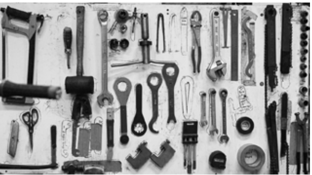
Pre-pandemic, these tools were also available for cyclists for DIY bike repair.