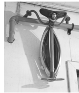
Fendi the Flying Turtle

"There is a wonderful sense of satisfaction when we take an old or neglected bike, breathe new life into it, and save it from a possible landfill fate. And that satisfaction is complete when someone buys one of our bikes and gets it back on the street!" the re-Cycles web-