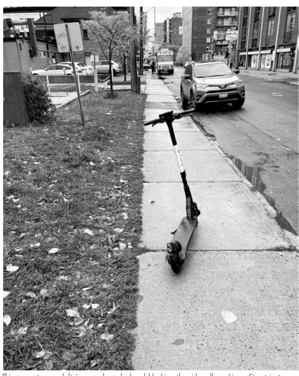
This e-scooter was left improperly parked and blocking the sidewalk on Lisgar Street just west of Bank Street on October 21.