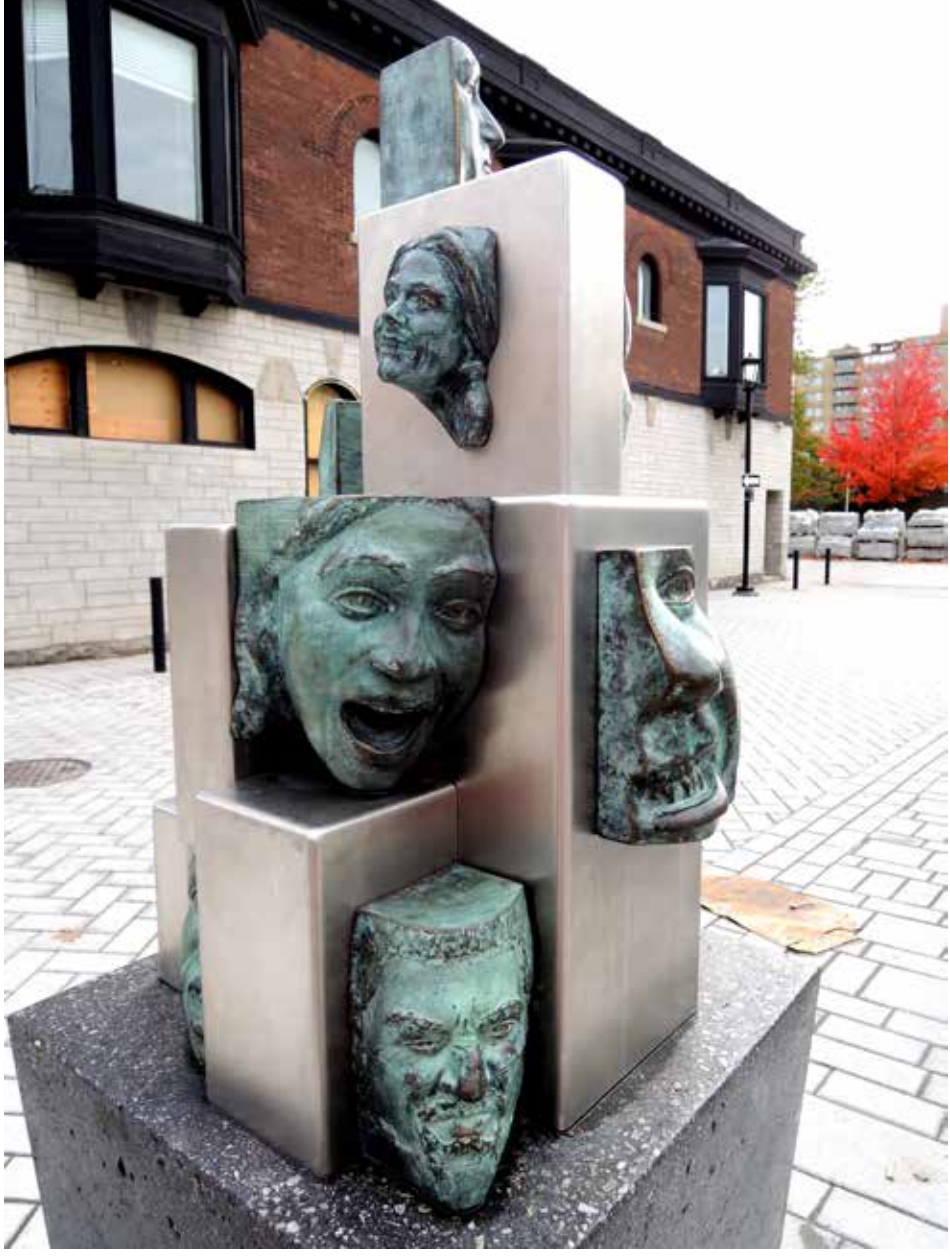
This stack of frozen bronze faces was caught grimacing in Boushey Square.