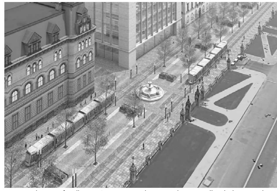
A concept drawing of Wellington Street converted into a pedestrian mall with the transit loop, prepared by McRobie Architects for the Supporters of the Loop. See more at transitloop.ca

"We think this is a project that gives us the foundation for public transit and how this national capital should work for a hundred years."