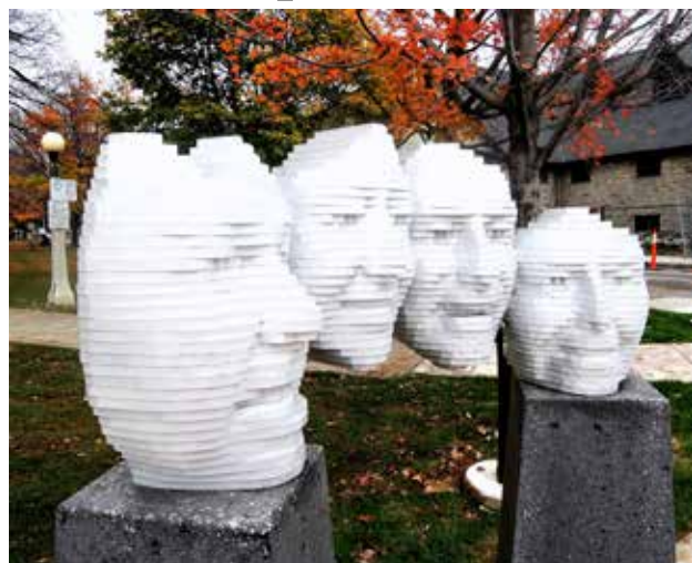
Some of the new Elgin St. public art's mirth, strung together like a mini-Mount Rushmore.