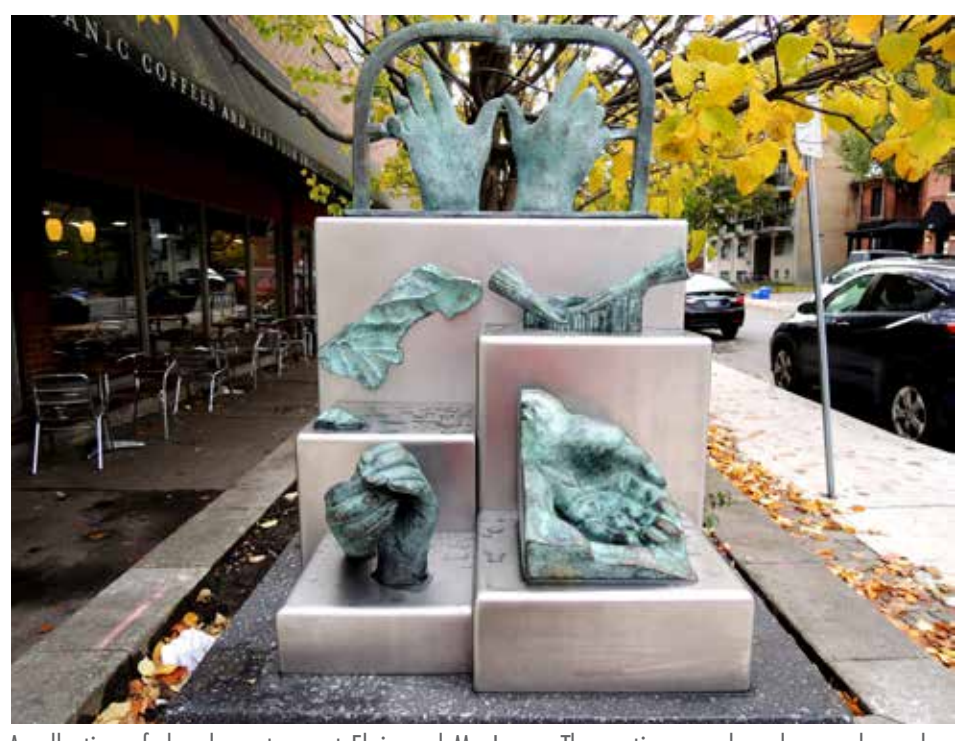
A collection of hands gestures at Elgin and MacLaren. The castings are based on real people found on the street.