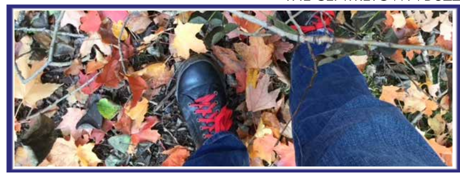
Virtual walkathon increases donations, 5