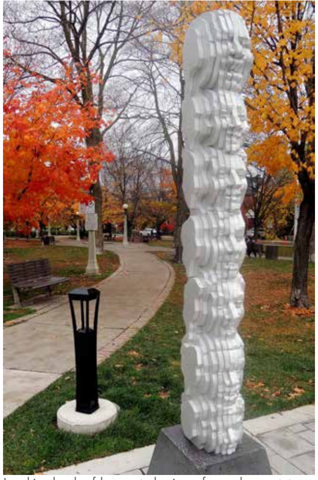
Laughing heads of laser-cut aluminum form a human totem pole in Minto Park.